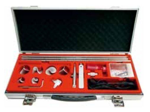
pic. 8, instrument case