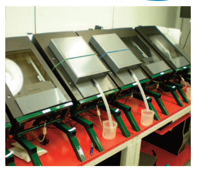
Sytems showing several cosms