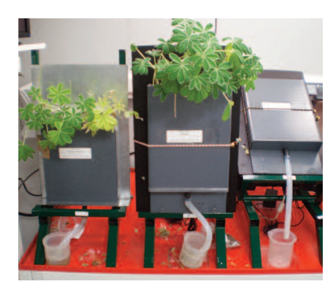
Plants grow inside a cosm