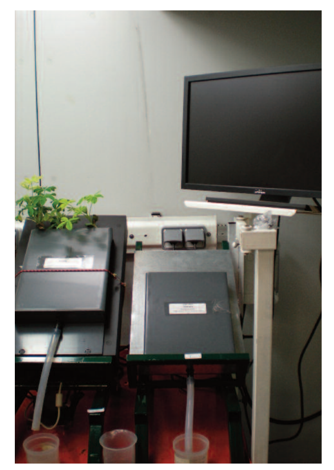
General view of the apparatus

SOILINSIGHT® makes it possible to observe and measure root growth throughout the growing cycle of the plant and follow the formation / destruction earthworms burrows, thus evaluating over time the impact of these biological agents on soil structure.