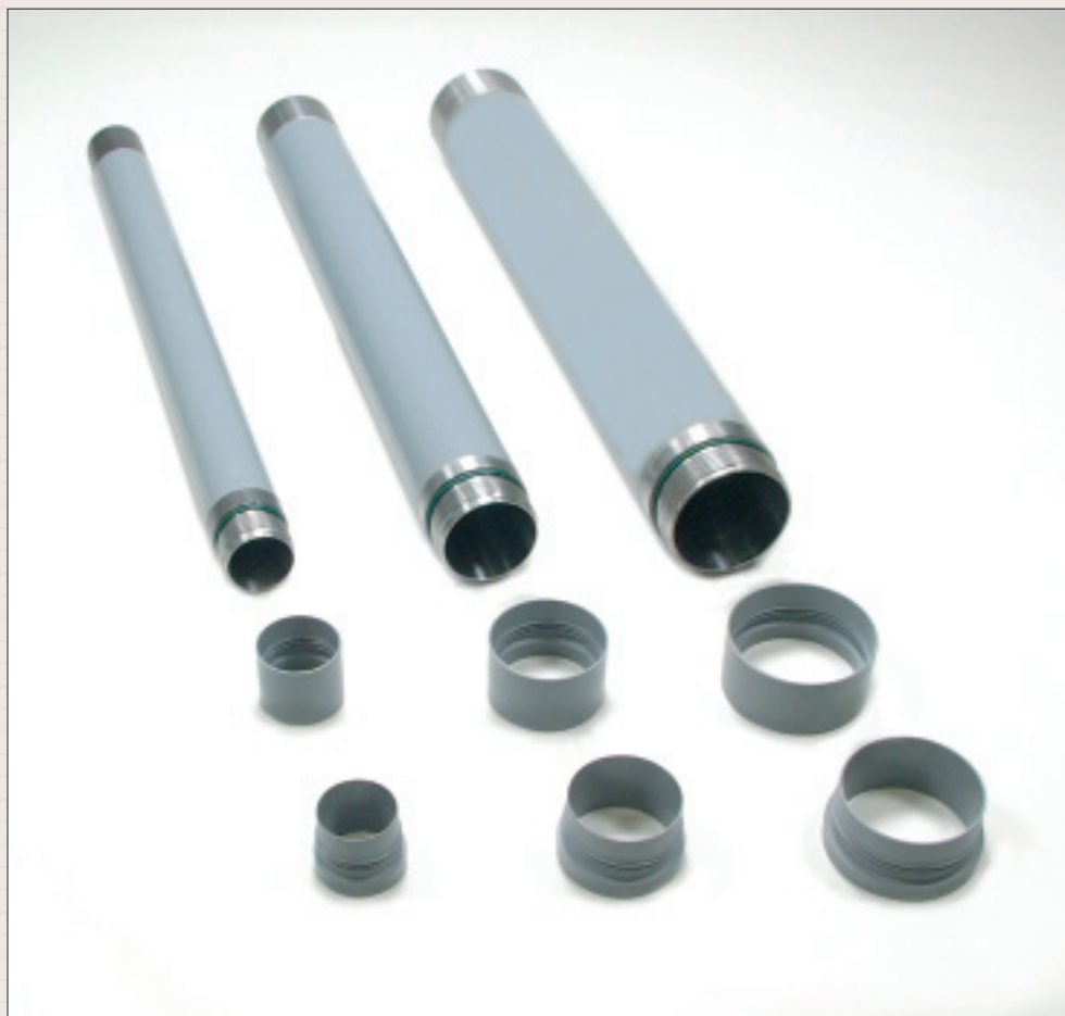
Casing tubes available in three diameters (90, 125 and 160 mm)