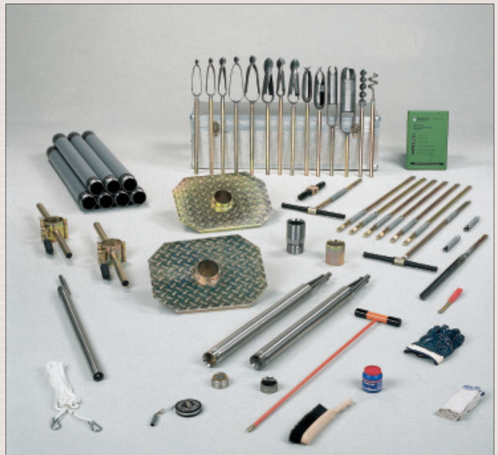
Hand-operated bailer boring auger set

The bailer, an essential part of the set, is a stainless steel tube with a stainless steel or synthetic valve on the lower part. By moving the bailer rapidly up and down loose material will collect in the bailer.