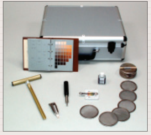
Soil quality determination kit

The compact set can be used for basic research of soil properties. The set can be applied e.g. for training purposes in schools and soil research by farmers and gardners. The set includes a small gouge auger to sample the top layer, cleaning spatula, soil colour book, pocket penetrometer, pocket hand sieve set, pH indicator and a synthetic transport case.