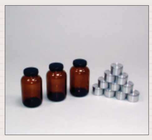
Sample flasks and aluminium boxes