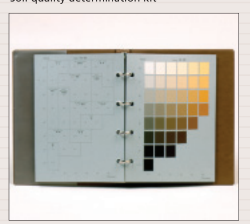
Soil colour chart