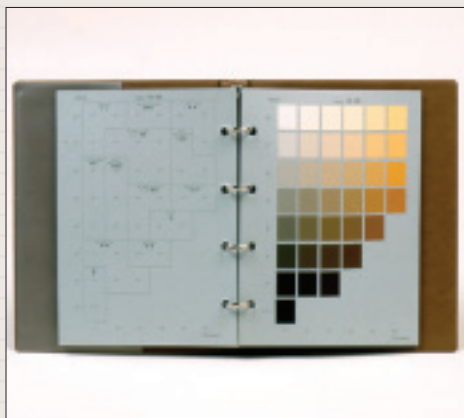
Soil colour chart