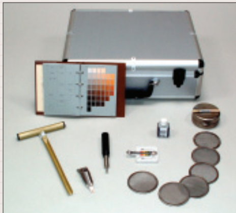
Soil quality determination kit

The compact set can be used for basic research of soil properties. The set can be applied e.g. for training purposes in schools and soil research by farmers and gardeners. The set includes a small gouge auger to sample the top layer, cleaning spatula, soil colour book, pocket penetrometer, pocket hand sieve set, pH indicator and a synthetic transport case.