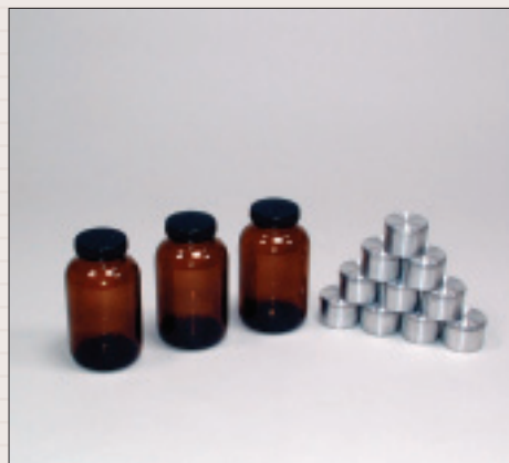
Sample flasks and aluminium boxes