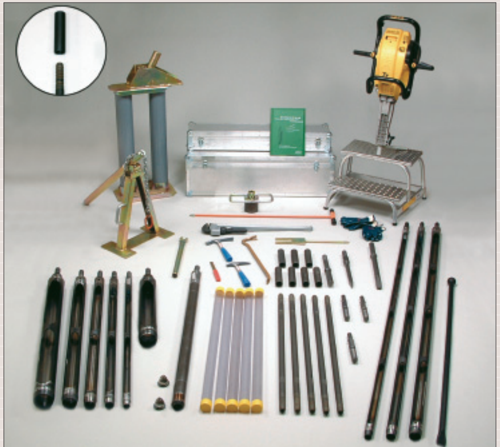
Percussion drilling set with gasoline powered percussion hammer (04.19.SC)

Using these sets the percussion gouges are hammered into the soil using an electrically driven percussion hammer with resp. 33.7 and 36.4 Joule beating power. The advantages of these hammers are: no petrol vapors and exhaust gasses directly over the sample. The sets contain: an electrically driven percussion hammer with accessories, an aggregate (continuous power 3300 W), an insulation guard, various extension rods, coupling sleeves, percussion gouges (combination type) in various diameters and lengths, a core sampler for pvc sample tubes and foil liners, a mechanical rod puller, an universal casing and rod puller clamp, a rod puller extension, accessories to empty and clean the gouge, a lifting jack with lever and chain, an utility probe for safe cable finding, stairs, etc. and aluminium transport cases.