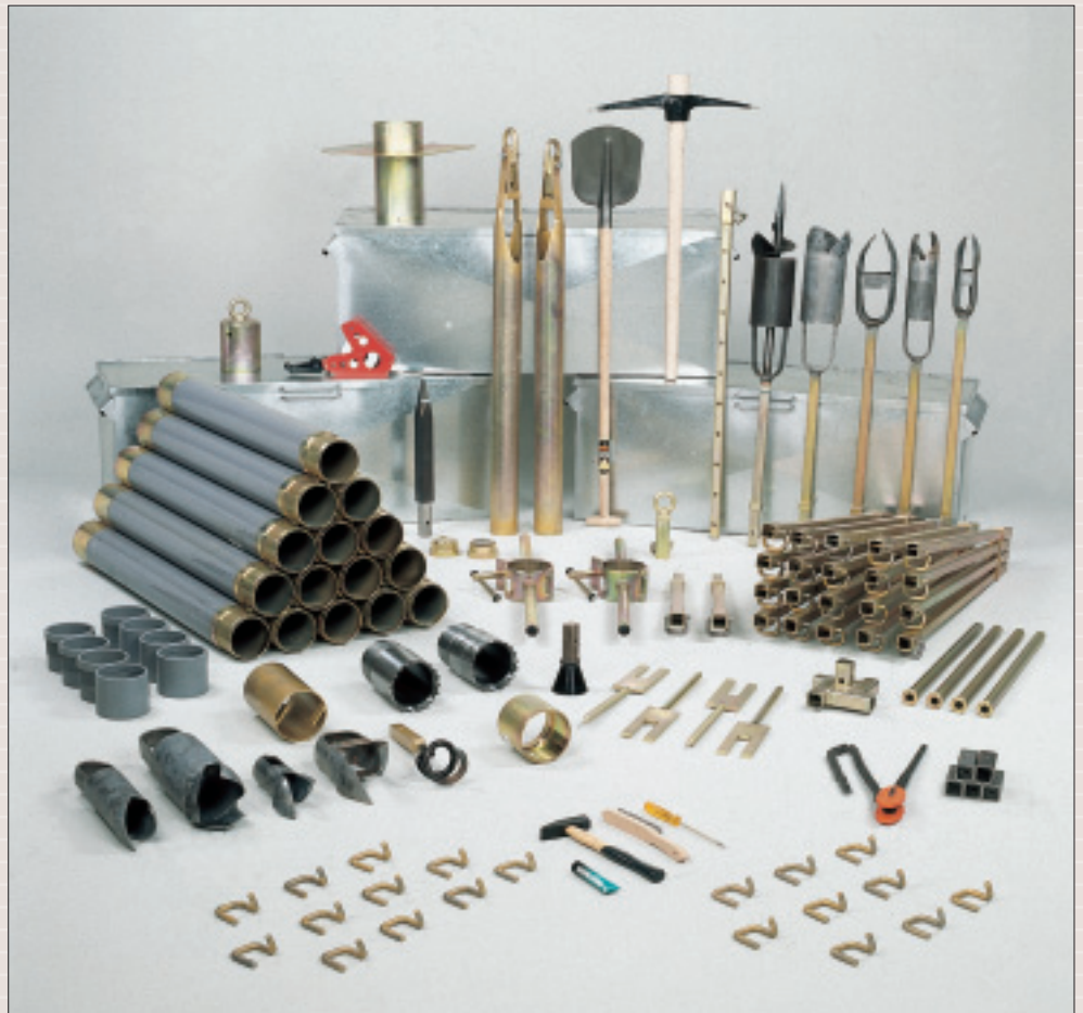
Water well drilling set (15.02 SA)

The standard set (with square 30 mm connection) is equipped with, amongst other things: a tool guide, crosspiece and kelly, handles, various extension rods, rod catchers with cleaning point, Riverside augers, an elongation piece for Riverside and