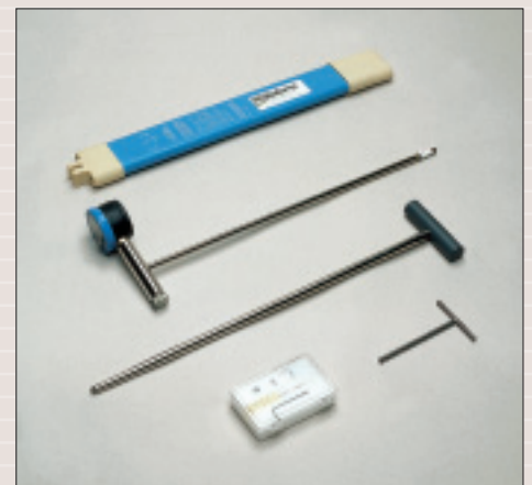
Quick draw tensiometer