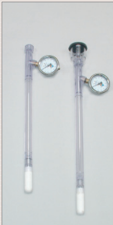
Standard and Jet-fill tensiometer

The electronic tensimeter is a portable pressure sensor in a bag for measurement of the moisture tension in the soil, measured through a tensiometer tube placed in the soil. The measuring device can be moved from tensiometer tube to tensiometer tube allowing an unlimited number of measurements over a short period of time. The hypodermic needle of the tensimeter is fitted on the tensiometer tube through the silicon stopper after which the moisture tension can be read. The meter has a measuring range of 0-1000 hPa with an accuracy of less than 2%. Tensiometer tubes are available in various lengths.