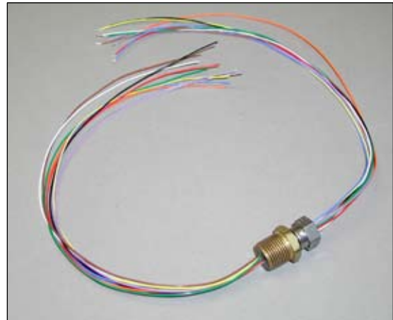
Model 1066 Electrical Leadthrough - 3/8 NPT Brass Fitting

The electrical leadthrough (Catalog No. 1065) pressure rated for use with: Model 1000, 0-15 Bar Pressure Membrane Extractor Model 1500, 15 Bar Ceramic Plate Extractor Model 1600 5 Bar Pressure Plate Extractor