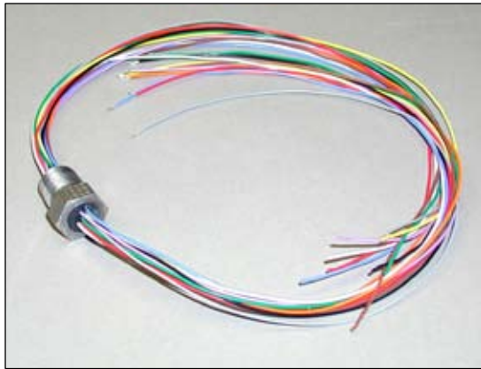
Model 1065 Electrical Leadthrough - 1/4 NPT Stainless Steel Fitting