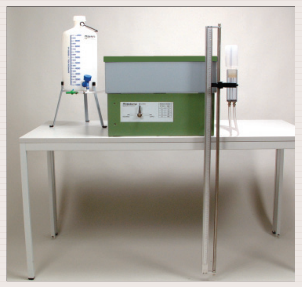
Sandbox for pF-determination (pF 0 - 2.0)