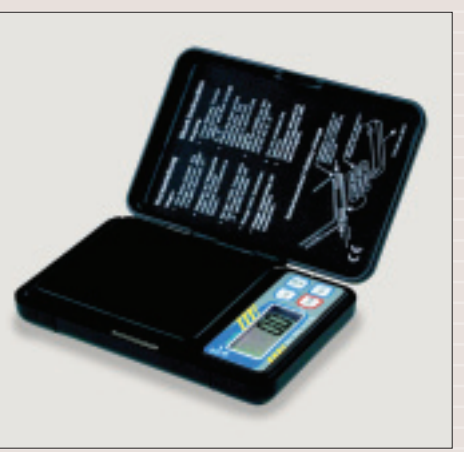
Portable field balance