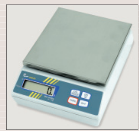
Electronic balance capacity 4000 g