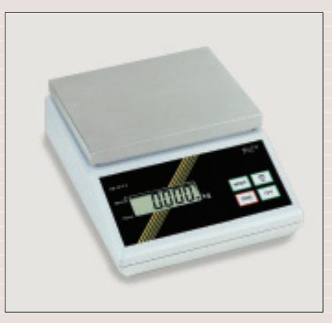
Electronic balance capacity 12000 g