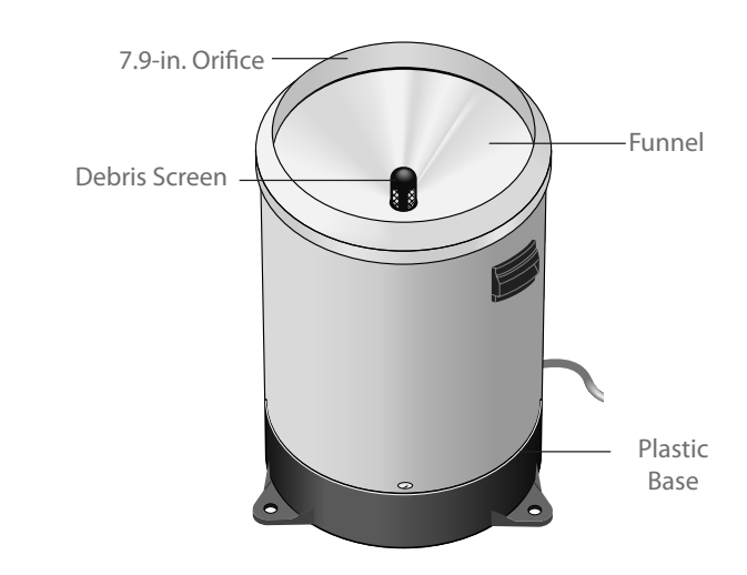
Both the TB4 and TB4MM have a UV-stabilized plastic base.

Campbell Scientific offers the 260-953 Wind Screen to help minimize the affect of wind on the rain measurements. This wind screen consists of 32 leaves that hang freely and swing as wind moves past them.